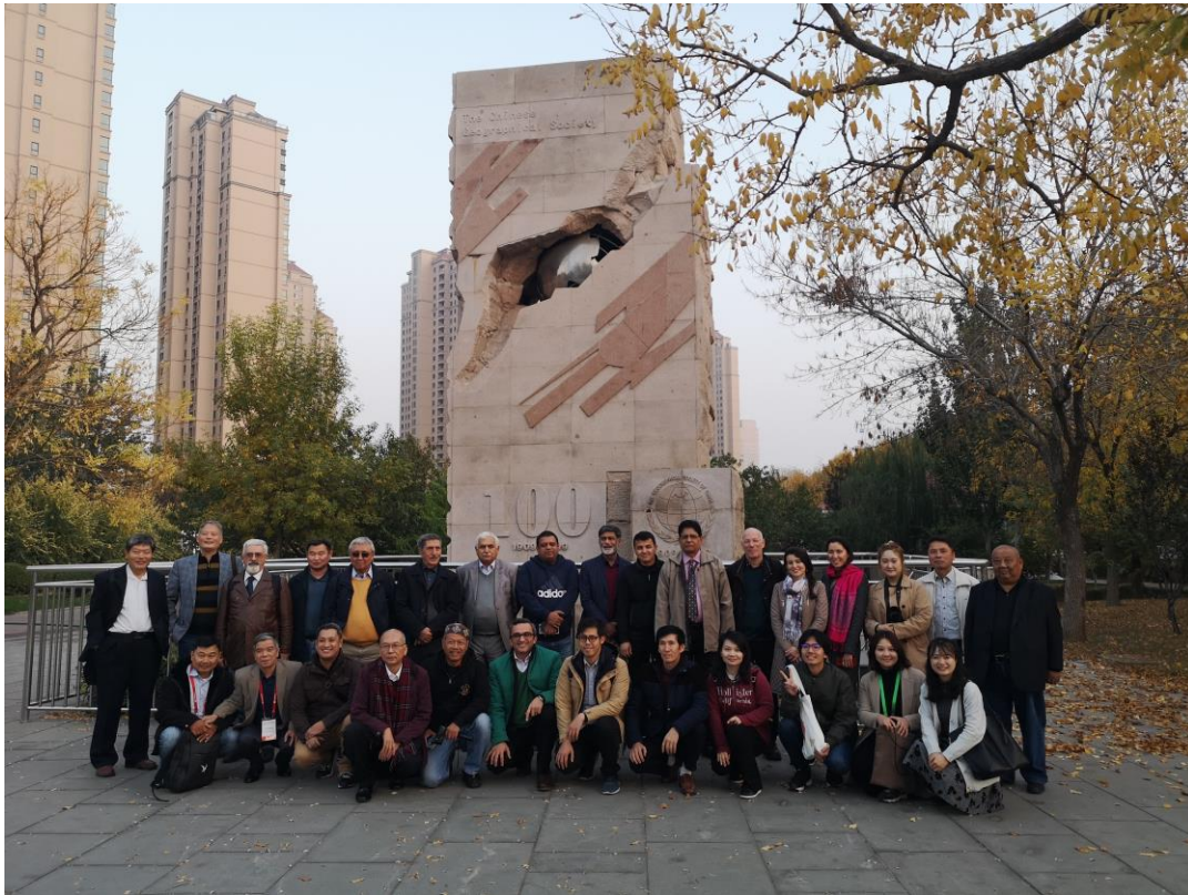
Group photo of AGA colleagues in front of the Monument to the 100th Anniversary of the Geographical Society of China, Tianjin