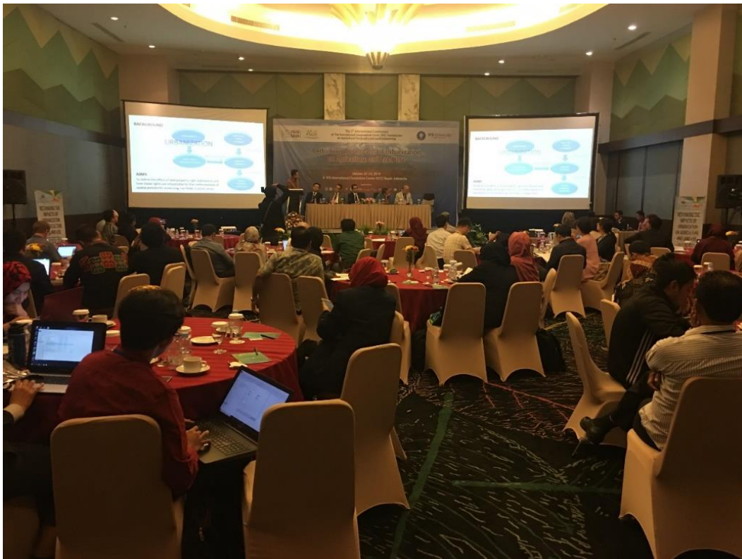
Opening ceremony at the IPB International Convention Center, Bogor, Indonesia