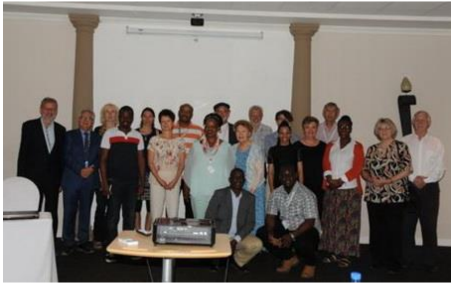
The group of participants